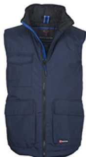
DRESS BLU NAVY/BLU ROYAL