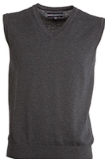
GRIGIO CENERE MELANGE