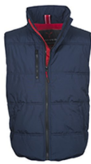
NAVY DRESS BLUE/ROSSO