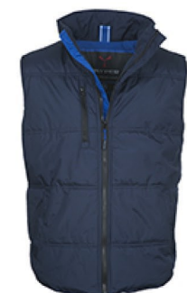
NAVY DRESS BLU/BLU ROYAL